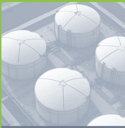
Oil & Gas Downstream