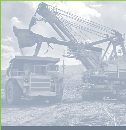
Mines & Metallurgy