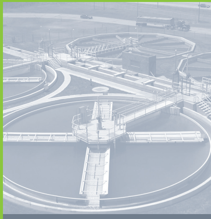
Water & Utilities