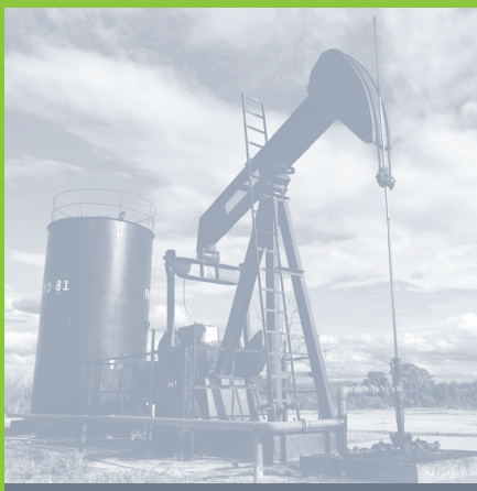
Oil & Gas Upstream